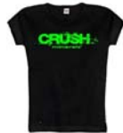
CRUSH minerals™ T-Shirt

This super soft T is the perfect partner for your favorite jeans or mini. The amazing CRUSH minerals logo bag holds more make up than you could possibly imagine yet it is still the cutest little make up bag you have ever seen!